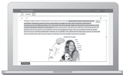
Laptop: McGraw Hill; Woman/DOG: George Doyle/Getty Images